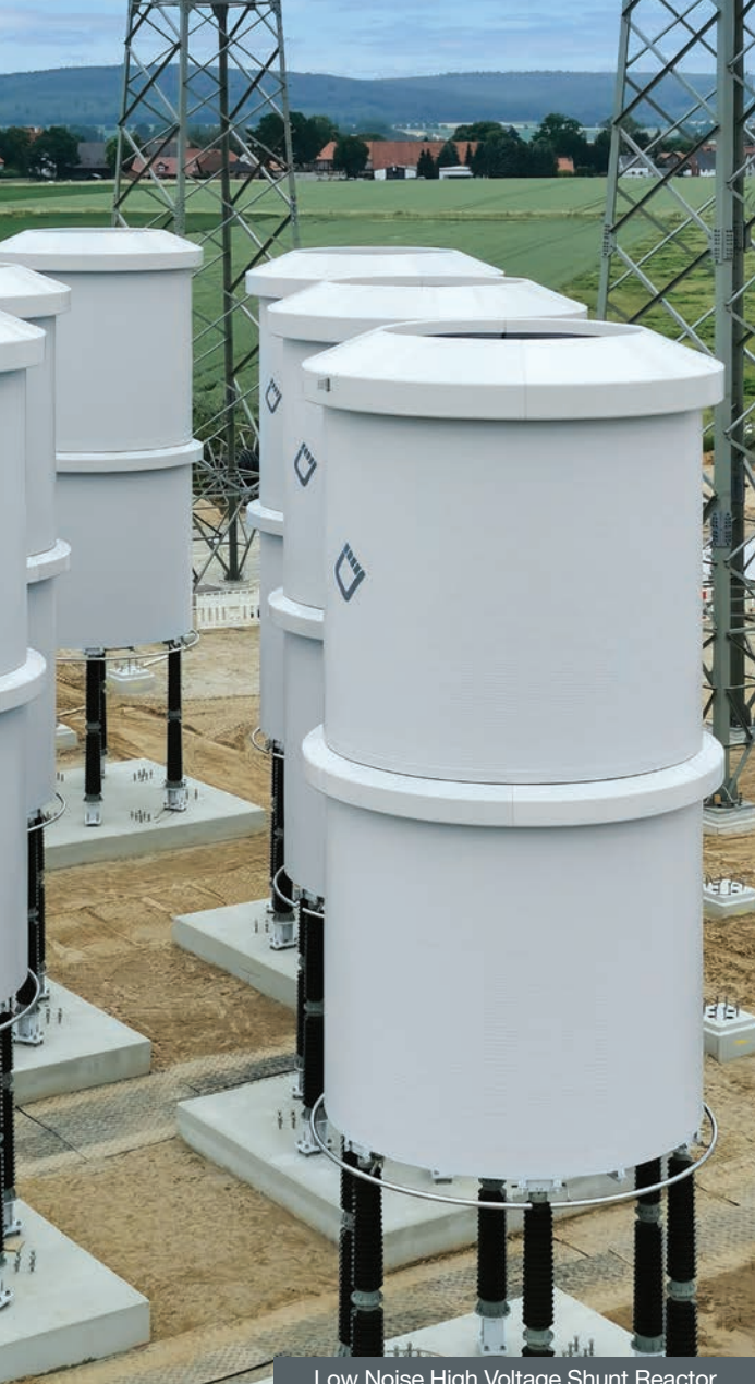
Low Noise High Voltage Shunt Reactor